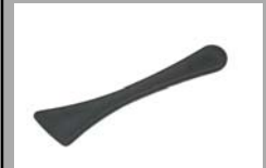
VMAX APP TOOL

VMAX vibration damping sheets are constructed of an advanced, non-curing, lightweight butylene rubber bonded to a thin, 4 mil layer of black anodized aluminum. Unlike extensional types of vibration damping materials, VMAX has been engineered to oppose vibration through compression or shearing of the aluminum layer (Constrained Layer Damper). VMAX vibration damping sheets are lightweight and require no special tools to install however the VMAX application tool is available to treat hard to reach areas. The VMAX damping sheet may be applied to sheetmetal, wood, fiberglass and plastic surfaces.